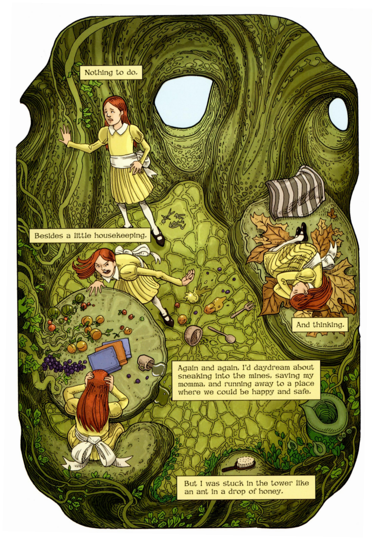
Figure 8, from Rapunzel's Revenge © Shannon Hale, Dean Hale, & Nathan Hale, Walker Books for Young Readers, 2008

thinking skills. In many ways, questions we ask about framing or positioning of panels are very similar to questions we ask students about syntax and its importance to meaning-making.