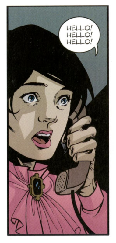
Figure 1, from Twilight Zone: The After Hours © Mark Kneece & Rebekah Isaacs,Walker Books for Young Readers, 2008

It should also be noted that both images (Figures 1 and 2) show universal emotional responses that any student, even readers struggling with English, can easily comprehend and process. The images can further develop students' conceptual knowledge of what abstract concepts, such as emotions, entail. Such knowledge can provide a basis from which students can visualize such moments in text without images.