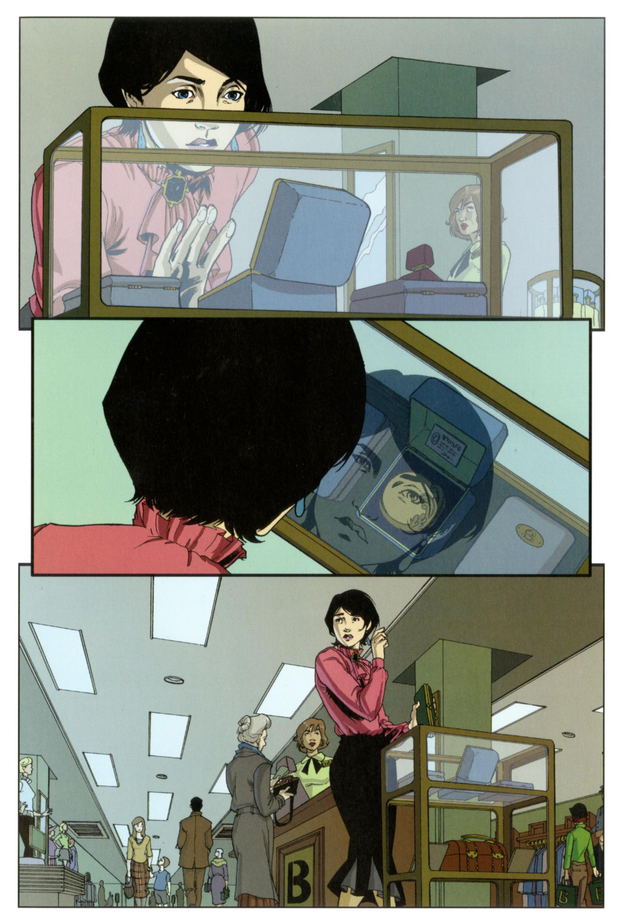
Figure 7, from Twilight Zone: The After Hours © Mark Kneece & Rebekah Isaacs, Walker Books for Young Readers, 2008