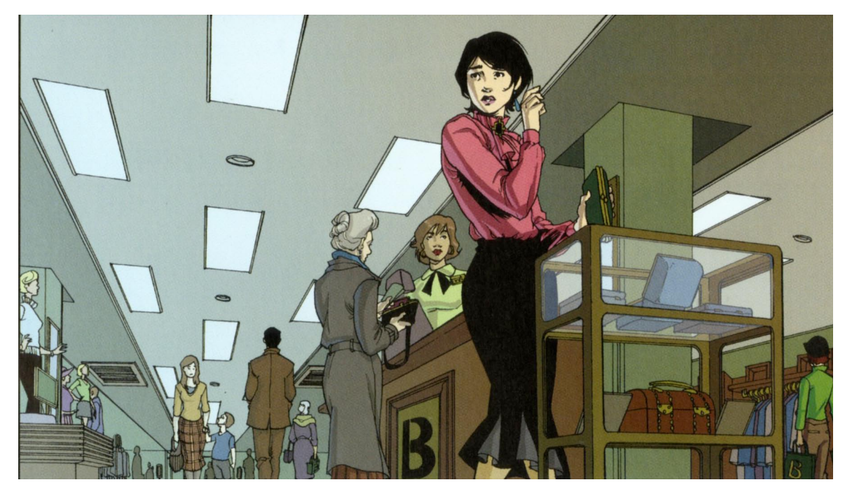
Figure 6, from Twilight Zone: The After Hours © Mark Kneece & Rebekah Isaacs, Walker Books for Young Readers, 2008

The situation in the last panel shows a more detailed setting with multiple stories converging around the protagonist, Marsha. In isolation, moving from one panel to the next, even with no words used by the author, our understanding of context drastically changes. We begin to see fuller bodies, more elaborate details of clothing, and a greater amount of detail for setting.