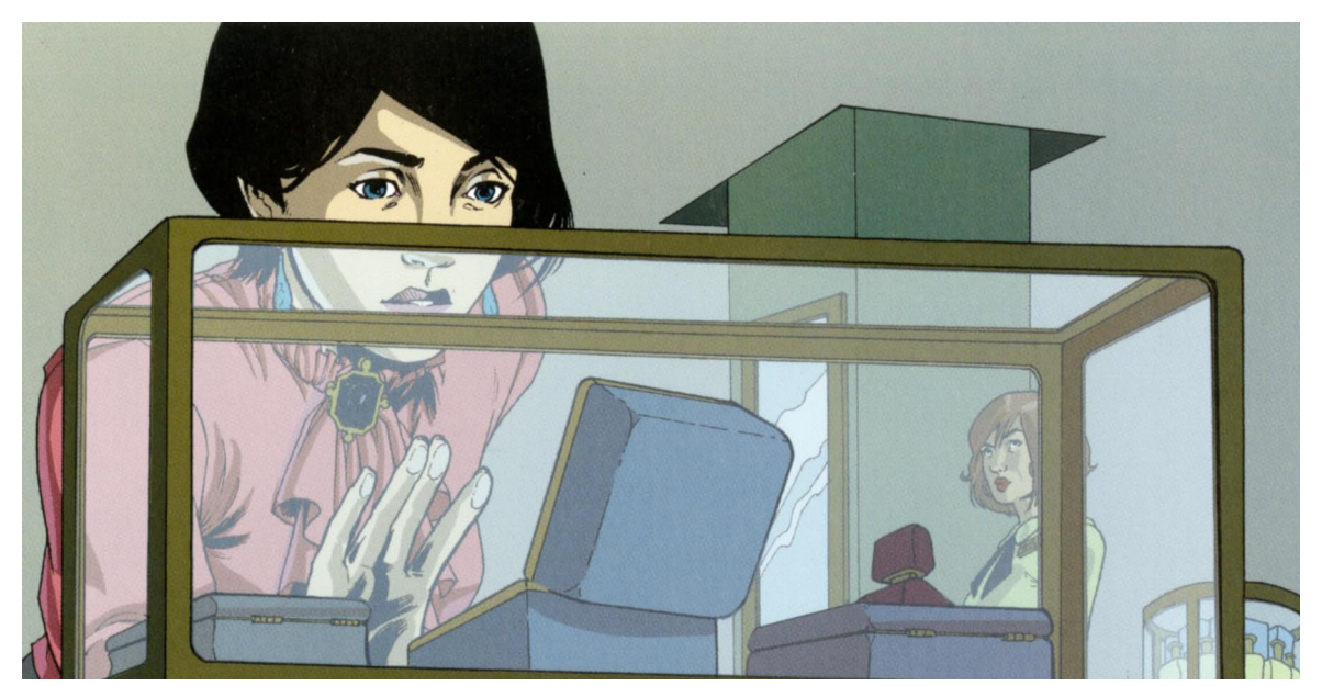
Figure 4, from Twilight Zone: The After Hours

We know there is a story in this one panel, and that this one panel is interrupting a more flowing narrative of life. However, the story we see is slightly limited. What happens if we add a second panel, telling the story of this panel from a different perspective? Do we see the story the same way?